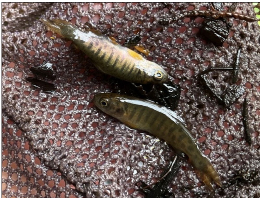
Figure 1.—Juvenile coho salmon captured at waypoint 1118.