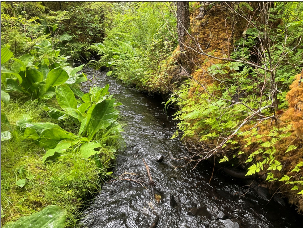
Figure 3.—Channel at waypoint 1117.