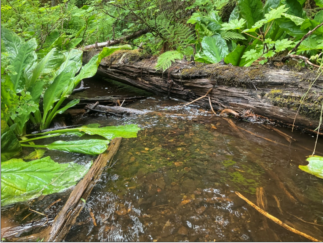
Figure 2.—Channel at waypoint 1118.